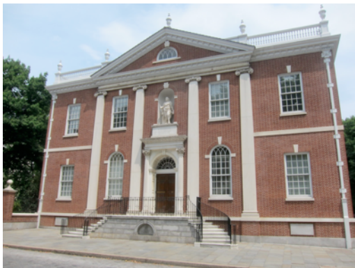
Congress Hall, Philadelphia

[p58] In countries where there is great private wealth much may be effected by the voluntary contributions of patriotic individuals; but in a community situated like that of the United States, the public purse must supply the deficiency of private resource. In what can it be so useful as in prompting and improving the efforts of industry?