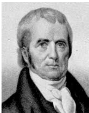
Chief Justice John Marshall

Although the Jacksonian time period is known as the "age of the common man " it did not embrace the immigrants . During the 1840's and 1850's large numbers of Irish and Germans began arriving. The Irish settled into Eastern cities. The Germans moved to the Midwest. Nativism reared its ugly head through secretive societies that tried to suppress the immigrant hordes. They even formed the political party called the Order of the Star Spangled Banner, more commonly known as the Know-Nothings .