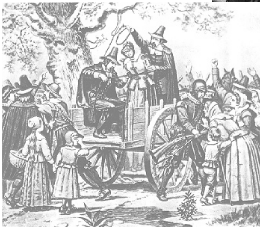
Salem Witch Trials 1692

They let the colonists have a great deal of economic and political independence under a policy called Salutary Neglect . England wanted the colonies to provide raw materials and become a marketplace for finished goods, under a policy known as Mercantilism . Indentured servants were the first laborers. This changed when Nathaniel Bacon led a rebellion of former servants against the government in 1676. The elite turned to a more controllable force of labor in slaves , which had first been brought to Virginia in 1619.