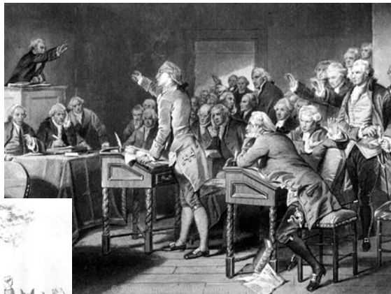
Virginia House of Burgesses est. 1619