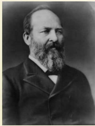
James Garfield (R) #20: 1881