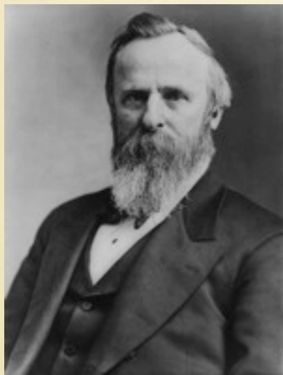
Rutherford B. Hayes (R) #19: 1877-1881

After Reconstruction, the presidency was dominated by Republicans who favored the interests of big business.