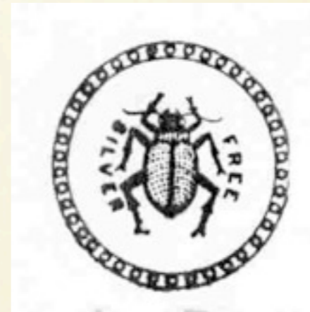
An 1896 campaign button