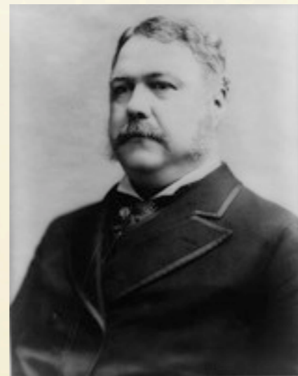
Chester A. Arthur (R) #21: 1881-1885