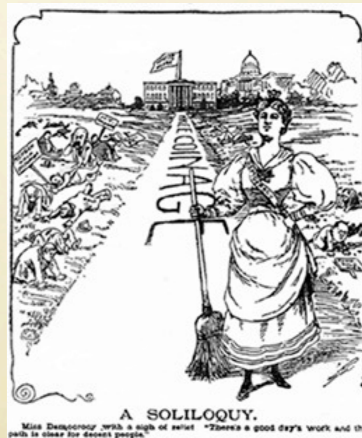
Rocky Mountain News, 9 July, 1896 A SOLILOQUY Miss Democracy, with a sigh of relief -- "There's a good day's work and the path is clear for decent people."

Did the idea for the Yellow Brick Road come from this?